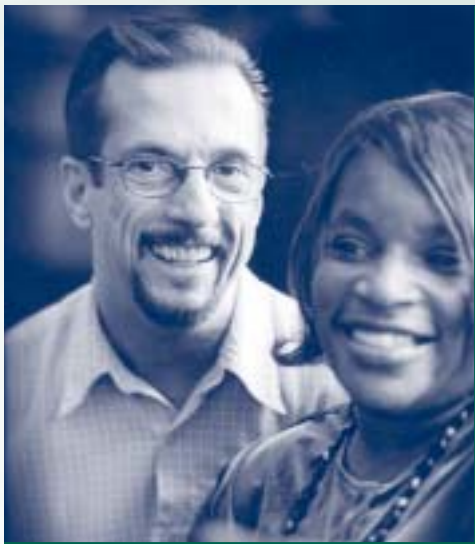
Charles Schwab & Co